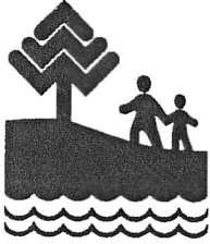
Exhibit A Ordinance 2019-42