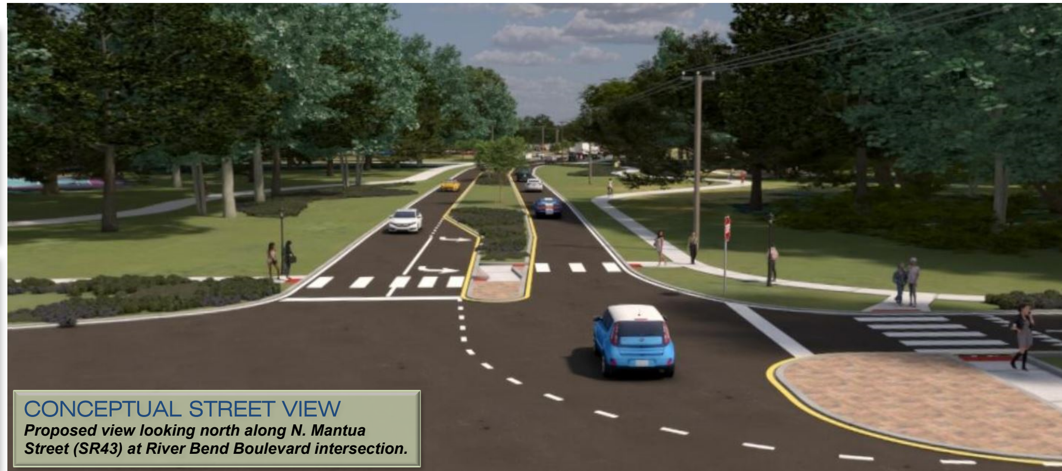
CONCEPTUAL STREET VIEW Proposed view looking north along N. Mantua Street (SR43) at River Bend Boulevard intersection.

A cooperative stakeholder agreement between the City of Kent, City of Kent Schools and Davey Tree has been established in which land would be donated to help facilitate the construction of this project. All property required for this project is currently owned by the City of Kent, Kent Schools, and Davey Tree Company.