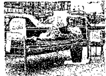
Kent State University, Johnson Hall, Special Collections and Archives

University leaders were not afraid to accept the veterans, but it quickly became clear that few provisions were in place to accommodate such an enormous flood of incoming students. Desperate to effect a positive outcome for those who had already sacrificed so much, community members and students aligned with dissatisfied veterans in organizing a "Bed for a Vet" protest. Dem-