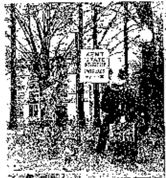
Kent State University, Johnson Hall, Special Collections and Archives

Over 10,000 returning veterans enrolled at Kent State under the G.I. Bill.