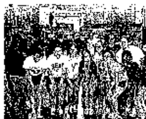
Students and staff pose after sorting medical supplies at Medwish International in Cleveland

Power Corps at the Student Rec Center. The day was a valuable introduction for these new students to the spirit of volunteerism that characterizes Kent State.