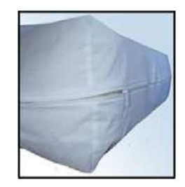
A zippered bed bug proof cover can help protect against