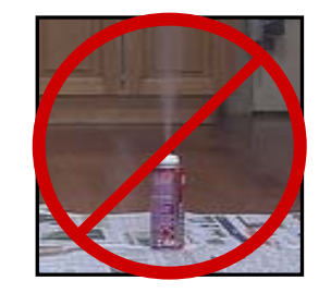
Do not use foggers