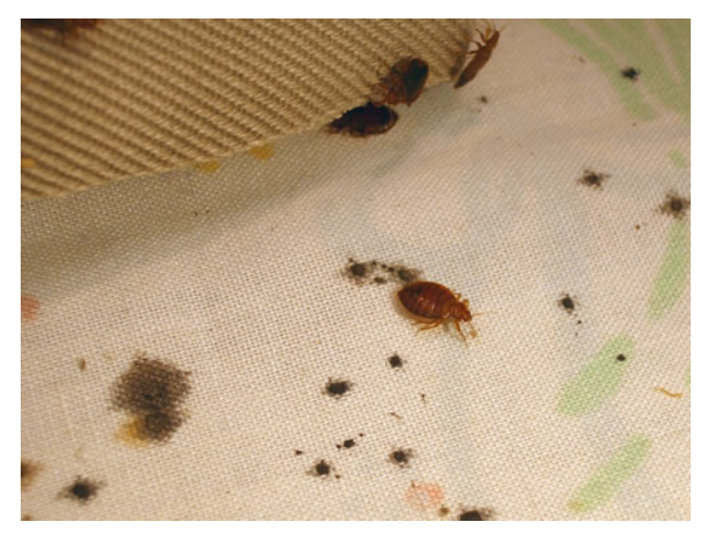
Bed bug adult and droppings on a mattress.