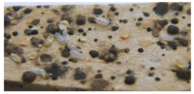
Bed bug droppings and eggs.